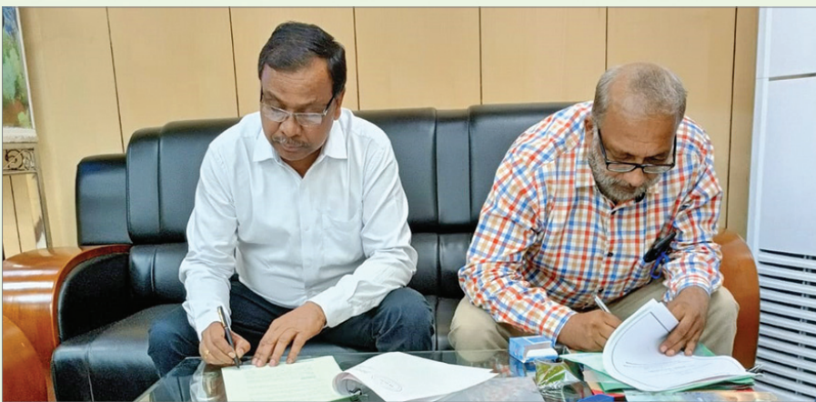
Signing of agreement between OPTCL (E.D,West Zone) & SAIL, RSP(E.D, Projects) for construction of 220KV Bay at Bonei GSS and Transmission line from Bonei GSS to Taldihi mines on dt 07.05.2022.