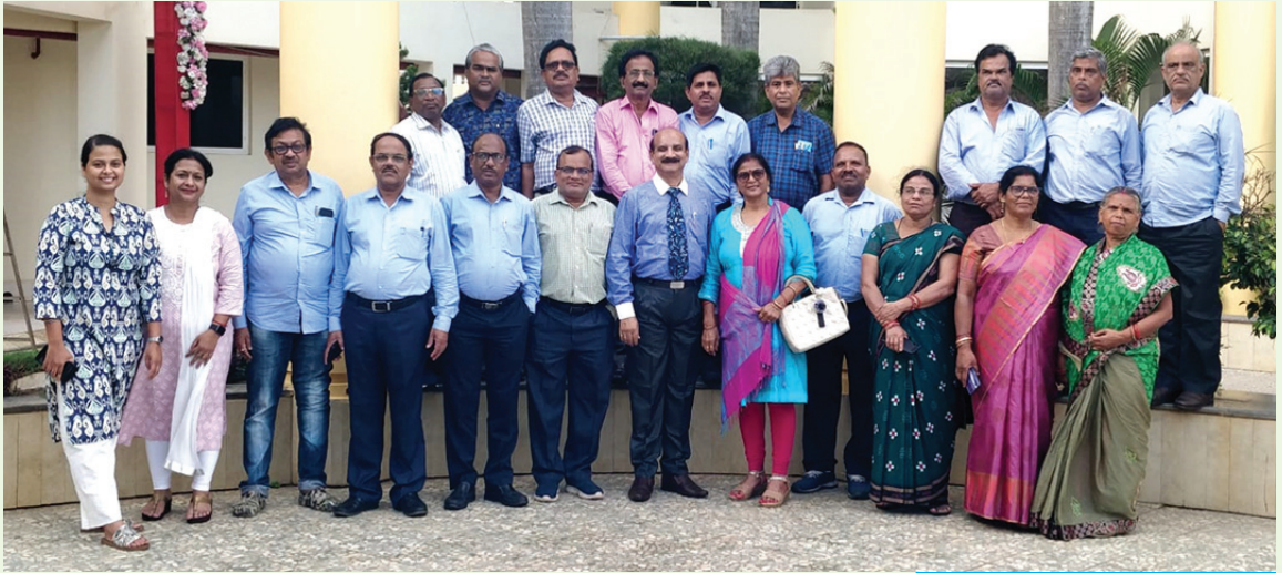
Training program on Charm in Post Retirement Life held at Hotel Empires, Puri